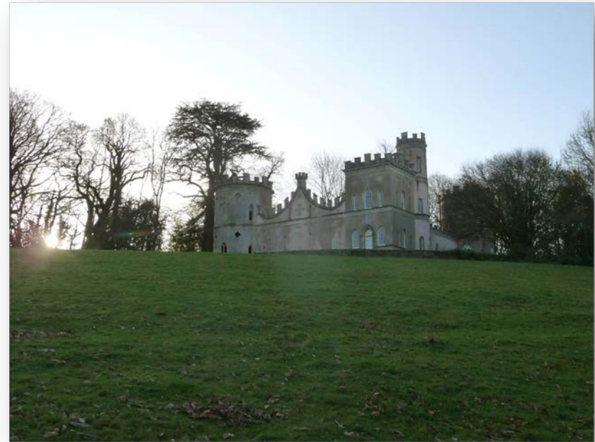
Clytha Castle Folly

No of Stiles: 7 Good paths across farmland and through woodland. Gentle ascent to Clytha Castle.