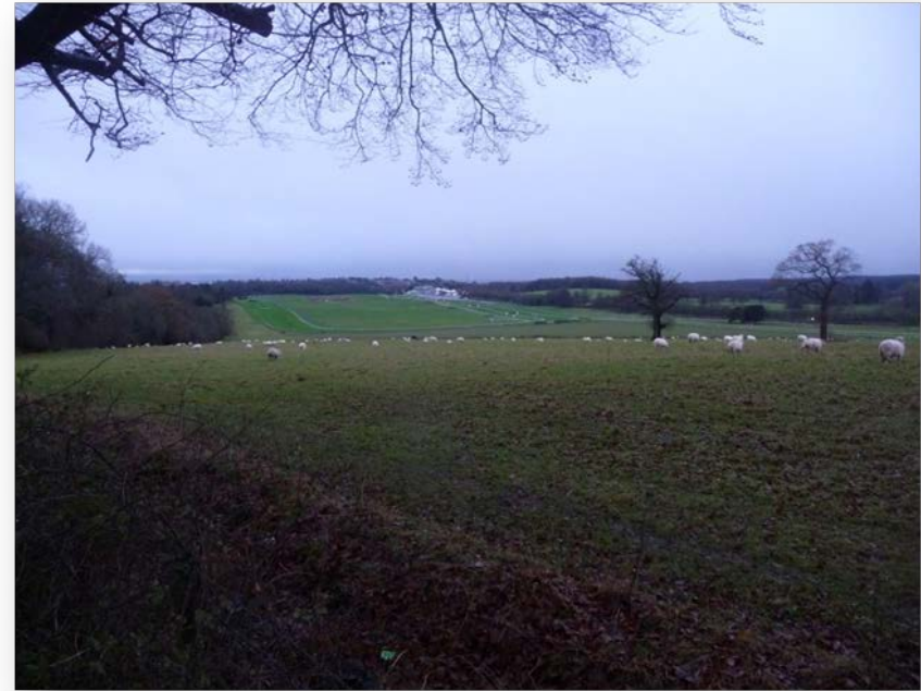
View towards Chepstow Race Course

Rough paths and tracks through woodland and across farmland