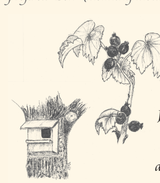
Blackcurrants & little owl nesting box

Several varieties of blackcurrants are grown over 100 acres. This allows for the staggering of mechanical harvesting from the second week in July through to mid-August. They are sold for making juice. Varieties include Ben Alder, Ben Avon and Ben Gairn; having been bred at The James Hutton Institute in Scotland they are prefixed 'Ben' (meaning mountain).