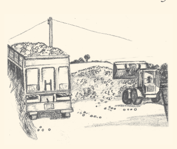
Gathering up the cider apples at the parking area

This orchard and Coedanghred Orchard next to