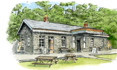
LLWYBR CLAWDD OFFA OFFA'S DYKE PATH