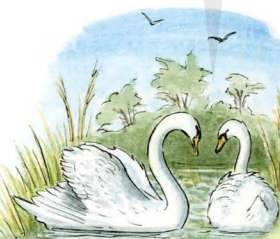
GWLYPDIROEDD CASNEWYDD NEWPORT WETLANDS

www.gwentwildlife.com/reserves/magormarsh.htm